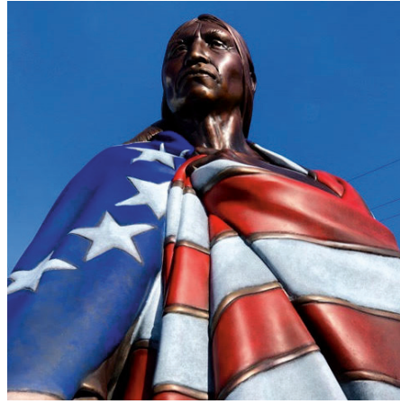
THE GIFT is cloaked in the U.S.A.'s first flag, the Continental flag. It is intended to represent the over 250 years of American Indian patriots who have served to protect our country's freedoms.