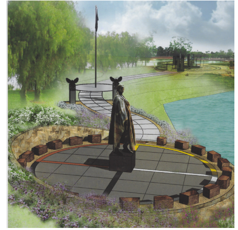
An artist's rendering of the American Indian Veterans Memorial.